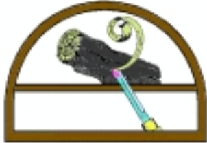
Gulf Coast Woodturners Association