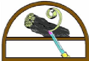
Gulf Coast Woodturners Association