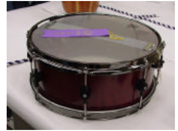
Derrick Furlow demonstrates that a woodturning can be extremely functional as well as beautiful.