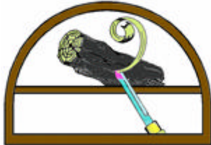
Gulf Coast Woodturners Association