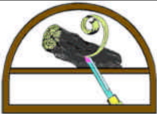
Gulf Coast Woodturners Association