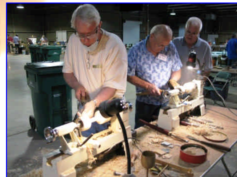
Making goblets at the Spring Retreat

June Meeting, June 18, 2005 Armand Bayou Nature Park 8500 Bay Area Blvd. Pasadena, TX