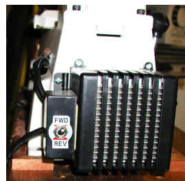
Switch mounted on the back of the control box.

This modification may have an effect on Jet's warranty for the lathe. There have been no permanent modifications of the lathe, motor or controller so it is reasonable to assume that the warranty will not be affected. If in doubt, the reversing switch can always be removed and the original circuitry re-connected.