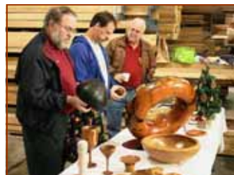
GCWA turners demonstrated a wide range of creativity at November's meeting, But then again, that's not at all unusual--we've got some terrific turners in this club!