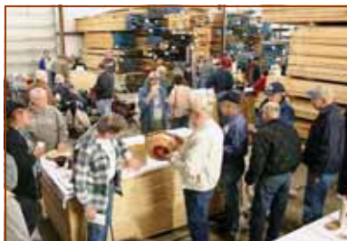
It seems as if a good crowd always shows up when we hold meetings at Clark's Hardwood Lumber. Is that because of the spacious meeting space or the free coffee & donuts?