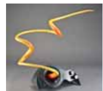
Feelin' Those Good Vibrations