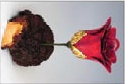
Chad Gardner Midland West Wood Woodworkers Fritchville, WA Woodworker Magazine