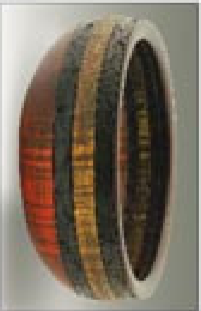
Tom Spauld Woodworkers Gard Systems, NJ Building Magazine and website